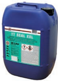
593 1252 TT SEAL XXL 20 l PE-barrel