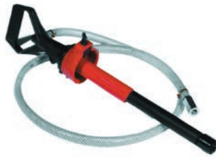
593 1277 TT SEAL XXL hand pump