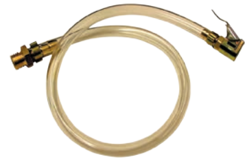
593 1284 Valve adapter